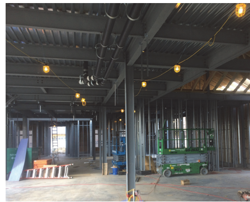
Bayside Recreation Center, Selbyville, DE