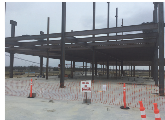
Bayhealth Health Campus, Milford, DE