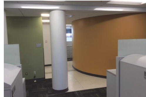
DuPont, Wilmington, DE

We have been extremely busy bidding projects on the East coast. The Bayhealth Health Campus, our largest project to date, is gaining momentum this spring. The Bayside Recreation Center in the south and our projects at DuPont in the north are also important jobs currently underway.