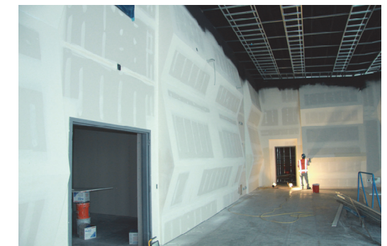
Uniquely designed angled walls for the Center