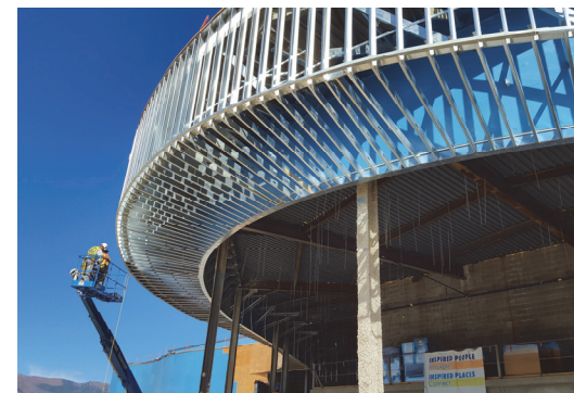
Exterior Framing for the Center