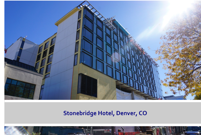
Stonebridge Hotel, Denver, CO