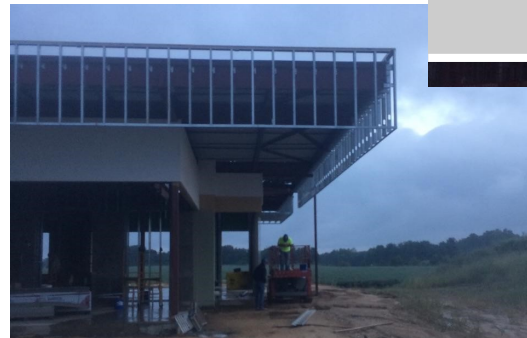
Temple B'Nai Israel, Easton, MD