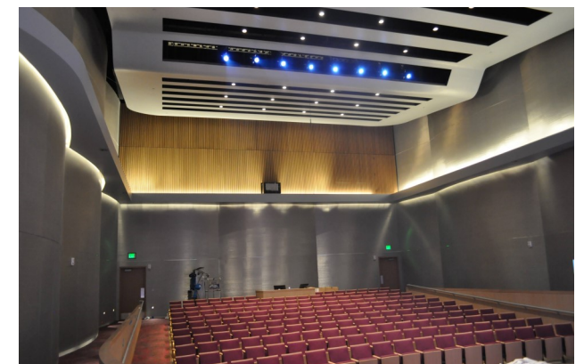
The Center for the Visual and Performing Arts at the University of Colorado, Colorado Springs, CO