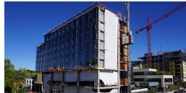
Stonebridge Hotel, Denver, CO