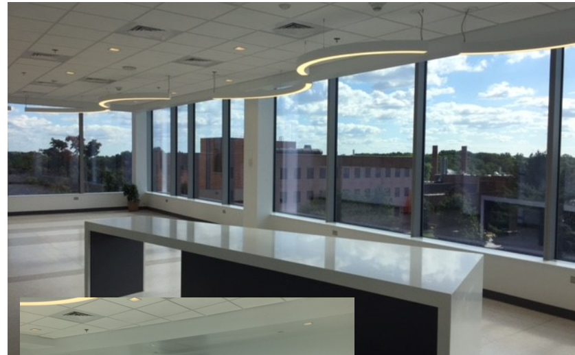
DuPont, Wilmington, DE