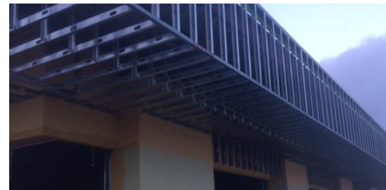
Temple B'Nai Israel, Easton, MD