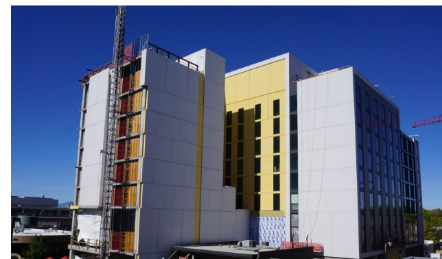
Stonebridge Hotel, Denver, CO