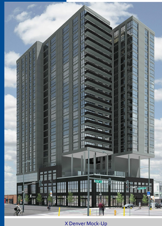
X Denver Mock-Up