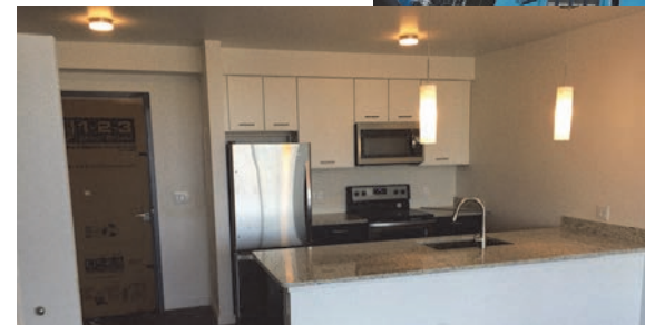
Finished Unit at Country Club Towers II: Denver, CO