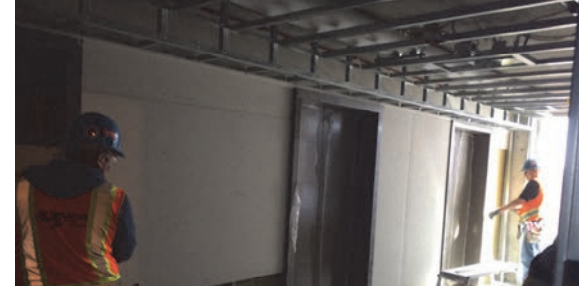
Country Club Towers II: Denver, CO