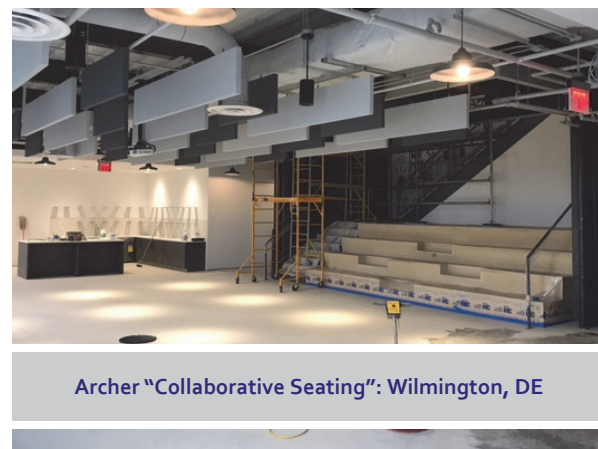
Archer “Collaborative Seating”: Wilmington, DE