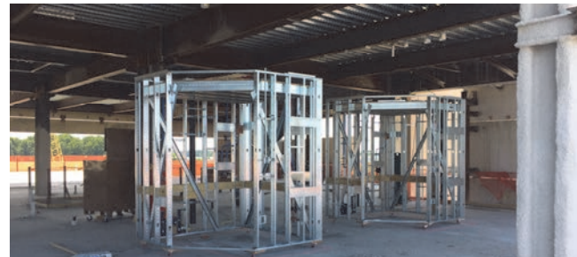
Pre-Fabricated Bathroom Pods at Bayhealth: Milford, DE