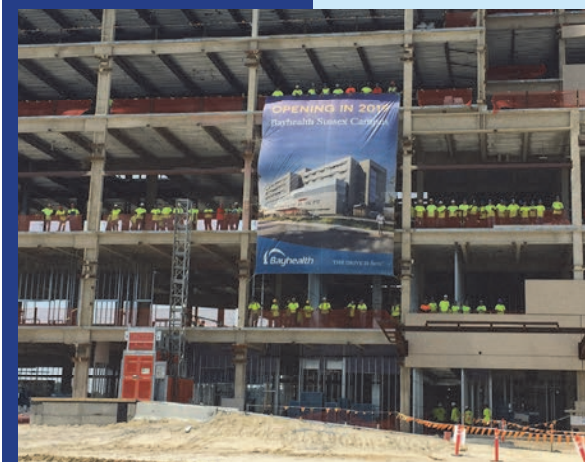
Spacecon employees at the “Topping Out Ceremony” at Bayhealth Health Campus: Milford, DE

(Please submit all suggestions on paper to your foreman or superintendent, or e-mail Belinda Seale at bseale@spacecon.com in the West or Nora Weder at nweder@spacecon.com in the East. Be sure to include your name and phone number!)