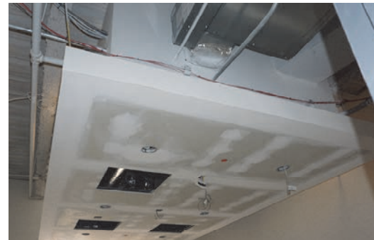
Archer Drywall Cloud Ceiling: Wilmington, DE