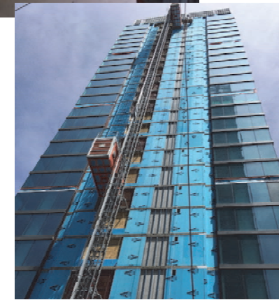
Country Club Towers II: Denver, CO