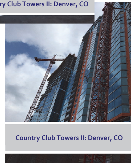
Country Club Towers II: Denver, CO